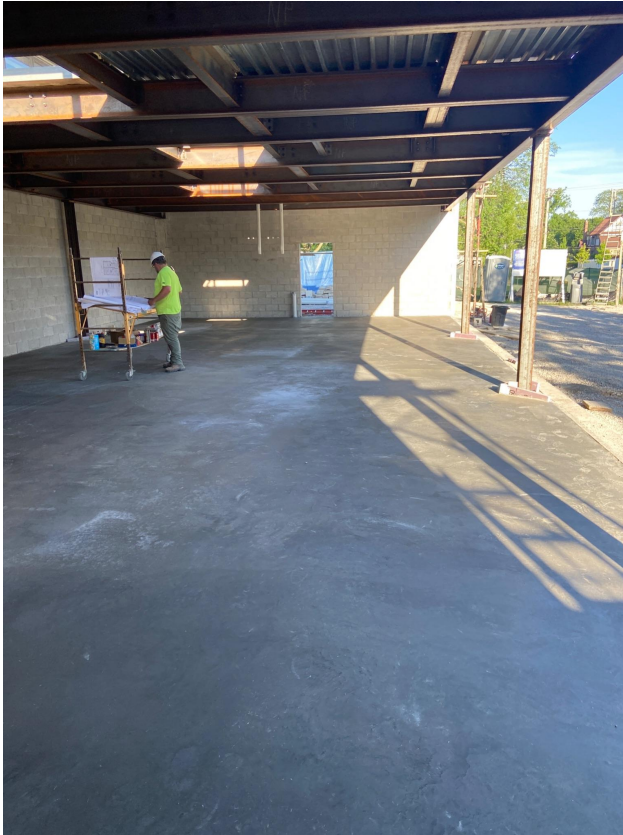
Media Center Addition