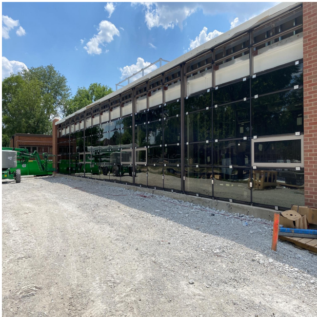
Media Center Addition